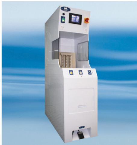
MTS Gradient Dryer stand-alone unit

The Gradient Dryer uses the difference between the surface tension of H 2 O and IPA to produce a gradient that generates fast and effective substrate drying. Surface tension gradient drying yields substrates that are watermark-free with low particle counts and no feature damage. Since there are no metallic components inside the dryer chamber, charge damage is virtually eliminated. There are no moving parts in the Gradient Dryer, and the elimination of spin drying dramatically reduces breakage, especially critical for today's thinner substrates.