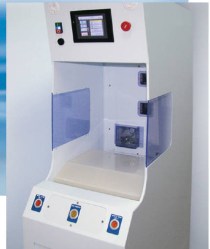
MTS Gradient Dryer is adaptable for silicon, solar, disk drive and other applications

Besides the elimination of watermarks on hydrophilic, hydrophobic and combination films, surface tension drying provides other benefits. This drying method does not place any mechanical stresses on the substrate. The technique works well on practically any flat substrate. No surfactants are necessary to change the substrate properties to enhance drying performance. Compared to traditional